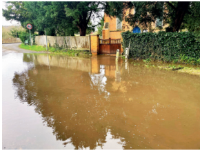
Sunday 3rd March - Welly wading