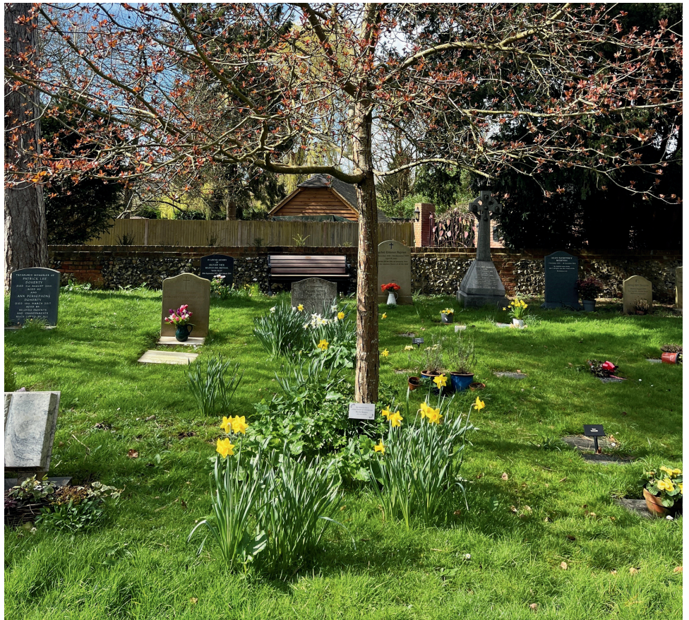
St Mary's Churchyard

Our churchyards and cemetery are not just where our loved ones are interred, but are peaceful places where the wilding zones encourage new life to be fostered. Over the last few years, flowers and insects have flourished. Life is not neat, and all God's creation cannot be constrained in neat lines. We see amongst death, God's creation, and as all the biodiversity proliferates, we give praise to God for all his gifts to us.