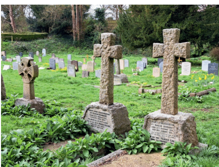
Top: St Peter's, Knowl Hill